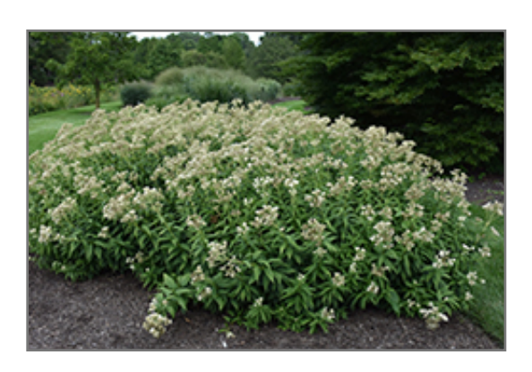
Summer Snow Joe Pye Weed in bloom

A majestic plant with good height for borders, this plant will fill the right sized space; flat topped clusters of vanilla scented, white flowers, attractive leaves and strong stems; an excellent pollinator friendly selection