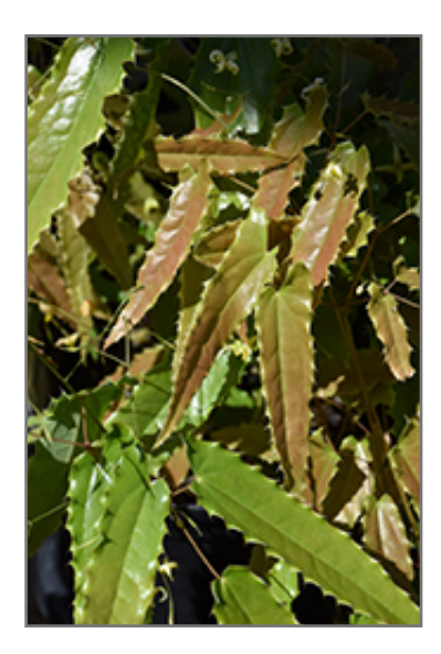
Spine Tingler Barrenwort foliage