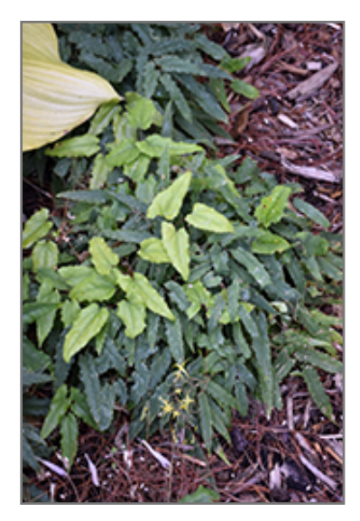
Spine Tingler Barrenwort