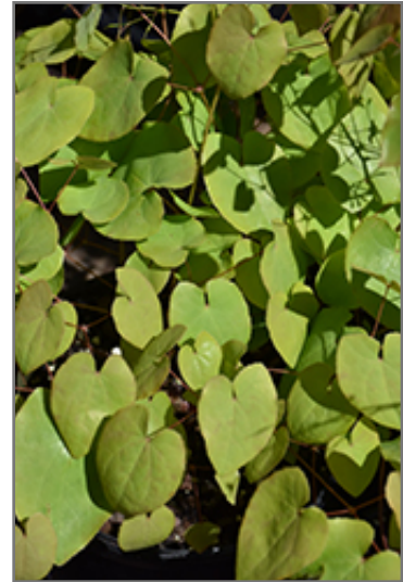
Black Sea Barrenwort foliage

Black Sea Barrenwort is recommended for the following landscape applications;