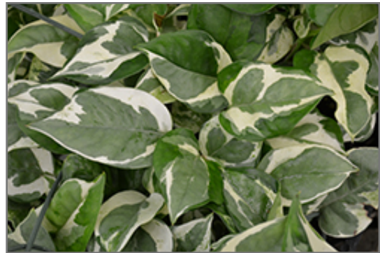
Pearls And Jade Pothos foliage

This is an herbaceous evergreen houseplant with a spreading, ground-hugging habit of growth. This plant can be pruned at any time to keep it looking its best.