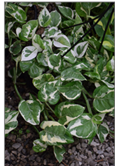
Pearls And Jade Pothos foliage