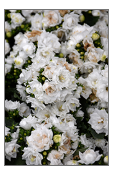
White Wonder Mee Bellflower flowers

This showy variety is perfect for rock gardens, edging, or in containers; loads of white bluebell-like flowers begin in early summer and bloom for weeks on end; a vigorous grower that is great as a small area groundcover