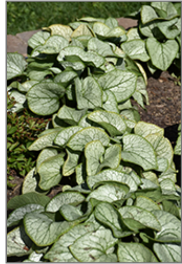
Silver Spear Bugloss