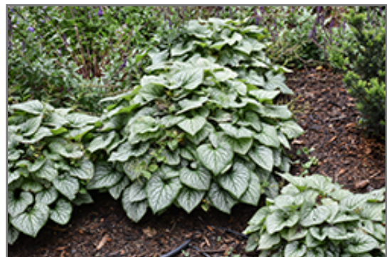
Alexandria Bugloss