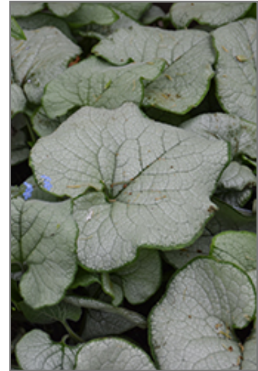
Alexandria Bugloss foliage

Alexandria Bugloss is a fine choice for the garden, but it is also a good selection for planting in outdoor pots and containers. It is often used as a 'filler' in the 'spiller-thriller-filler' container combination, providing a mass of flowers and foliage against which the thriller plants stand out. Note that when growing plants in outdoor containers and baskets, they may require more frequent waterings than they would in the yard or garden. Be aware that in our climate, most plants cannot be expected to survive the winter if left in containers outdoors, and this plant is no exception. Contact our experts for more information on how to protect it over the winter months.