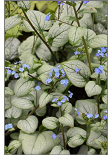
Alexandria Bugloss flowers

Alexandria Bugloss is recommended for the following landscape applications;