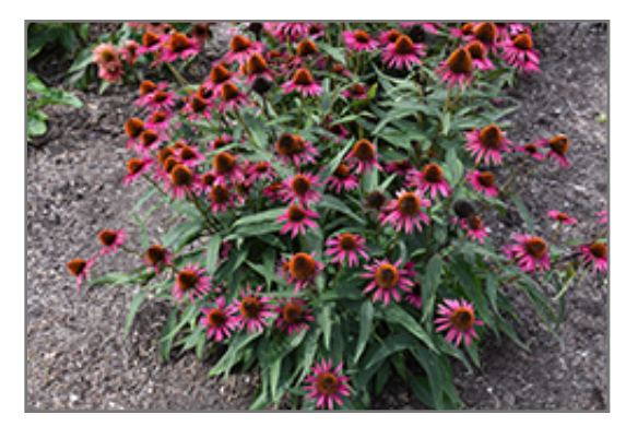
Pica Bella Coneflower in bloom

This is a relatively low maintenance plant, and is best cleaned up in early spring before it resumes active growth for the season. It is a good choice for attracting butterflies to your yard, but is not particularly attractive to deer who tend to leave it alone in favor of tastier treats. It has no significant negative characteristics.