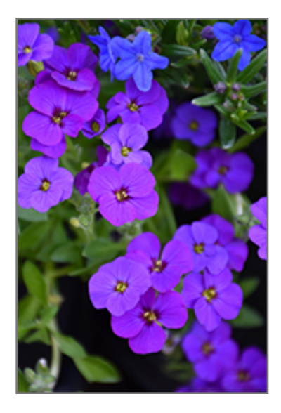
Rock On Blue Rock Cress flowers