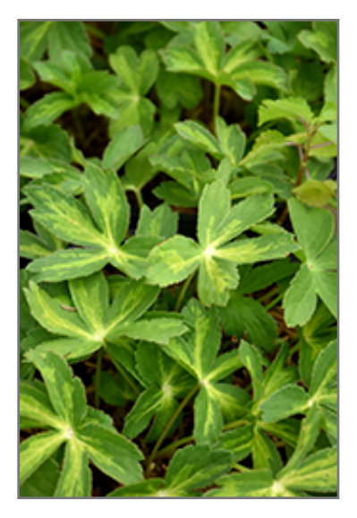
Masterpiece Masterwort foliage

A lovely selection that produces tall stems of charming pink pincushion flowers; an upright variety featuring variegated green and chartreuse, ferny foliage during the summer months; self-seeding, requiring some maintenance and pruning in the fall