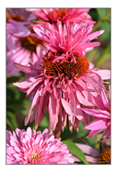
Double Decker Coneflower flowers

Beautiful and unique, this selection features 2 tiers of deep rosy-pink flowers, one recurved along the bottom while the other grows upwards on top of a deep brown cone; excellent for fresh or dried arrangements; heat, drought and humidity tolerant