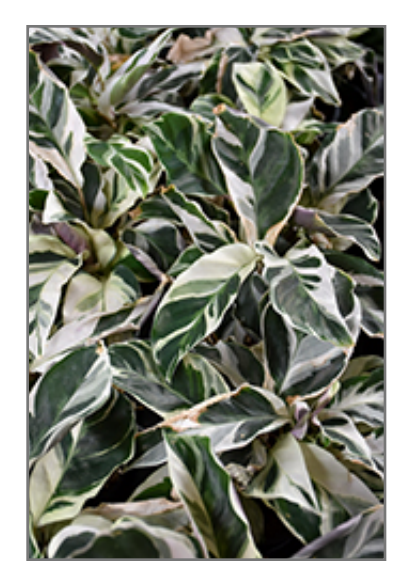
White Fusion Calathea foliage

When grown indoors, White Fusion Calathea can be expected to grow to be about 24 inches tall at maturity, with a spread of 24 inches. It grows at a slow rate, and under ideal conditions can be expected to live for approximately 5 years. This houseplant should only be grown away from direct sunlight or in a room with strong artificial light. It does best in average to evenly moist soil, but will not tolerate standing water. The surface of the soil shouldn't be allowed to dry out completely, and so you should expect to water this plant once and possibly even twice each week. Be aware that your particular watering schedule may vary depending on its location in the room, the pot size, plant size and other conditions; if in doubt, ask one of our experts in the store for advice. It will benefit from a regular feeding with a general-purpose fertilizer with every second or third watering. It is not particular as to soil pH, but grows best in rich soil. Contact the store for specific recommendations on pre-mixed potting soil for this plant.