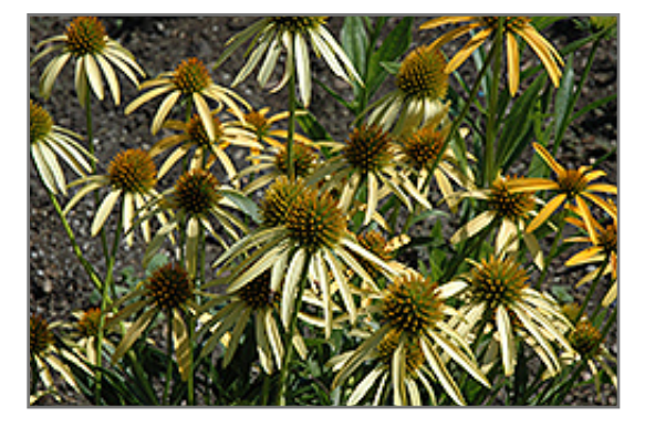
Mango Meadowbrite Coneflower flowers