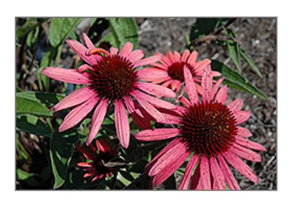
Big Sky Twilight Coneflower flowers

A remarkable variety with eye catching color; strong and bushy habit that is ideal for sunny borders and mixed containers; large and fragrant flowers have striking rosy-red petals surrounding a deep red cone; deadhead spent blooms