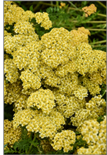
Milly Rock Yellow Terracotta Yarrow flowers