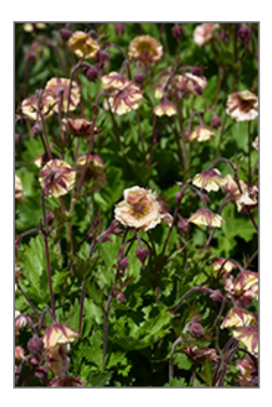
Pretticoats Peach Avens flowers