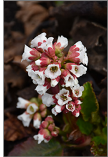
Peppermint Patty Bergenia flowers

Selected for large glossy, leathery, cabbage-like, deep green leaves; interesting clusters of white flowers with touches of pink rise above foliage; perfect for shady areas, water regularly but don't overwater; great coarse texture