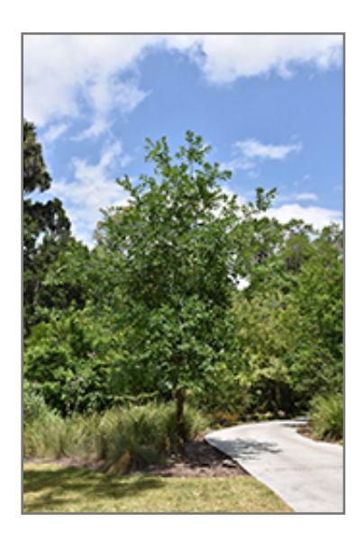
Bluff Oak