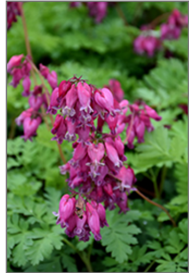
Luxuriant Bleeding Heart flowers

A compact variety with more heat and sun tolerance than most bleeding hearts; features lush mounds of blue-green foliage with arching sprays of nodding, cherry red, heart shaped flowers; blooms for an extended period, perfect for borders and containers