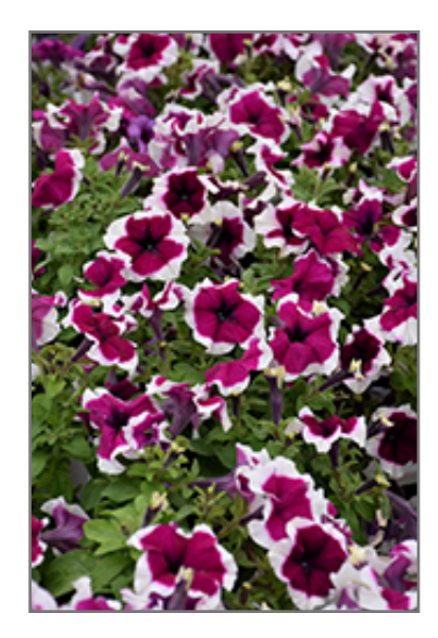
Dreams Burgundy Picotee Petunia flowers

Well branched with an upright mounded habit, ideal for containers, borders and garden beds; bright and vibrant colored blooms add a colorful display from late spring through summer; deadhead to encourage new blooms