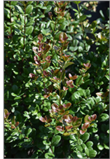
Simpson's Stopper foliage