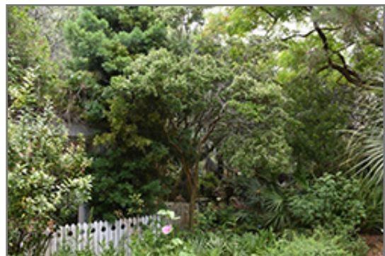
Simpson's Stopper in bloom