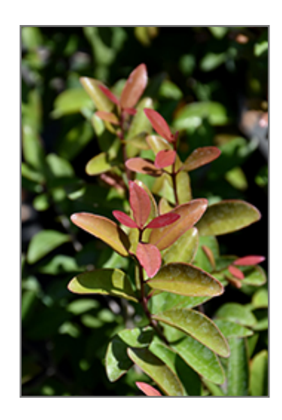
White Stopper foliage

White Stopper features showy clusters of fragrant white pincushion flowers with creamy white overtones and yellow anthers along the branches from mid spring to mid summer. It has attractive dark green foliage with hints of coppery-bronze which emerges red in spring. The glossy pointy leaves are highly ornamental and remain dark green throughout the winter. The fruits are showy red drupes with purple overtones and which fade to black over time, which are carried in abundance from mid summer to early fall. The rough gray bark and brown branches add an interesting dimension to the landscape.