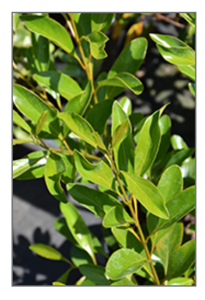
Florida Fiddlewood foliage

Florida Fiddlewood is recommended for the following landscape applications;