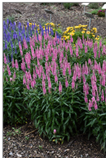
Skyward Pink Long-leaf Speedwell in bloom