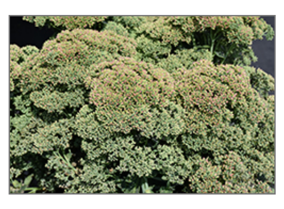
T Rex Stonecrop flowers

A highly desirable and popular groundcover, forming a dense mound completely covered in broccoli-like pink flowers; succulent dusty-green, toothy foliage is prominent the rest of the season; needs a dry and sunny location; remains tidy and compact