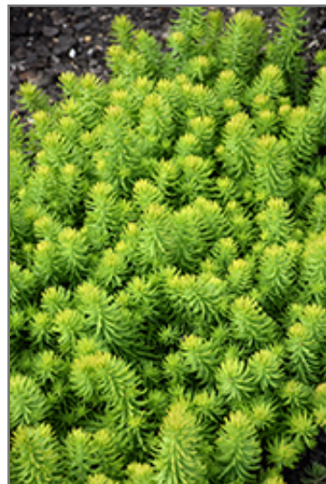
Prima Angelina Stonecrop

Prima Angelina Stonecrop is recommended for the following landscape applications;