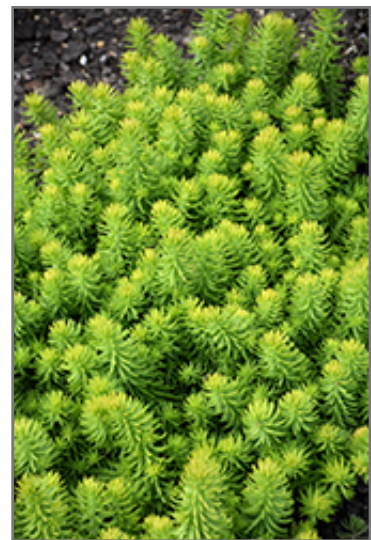
Prima Angelina Stonecrop