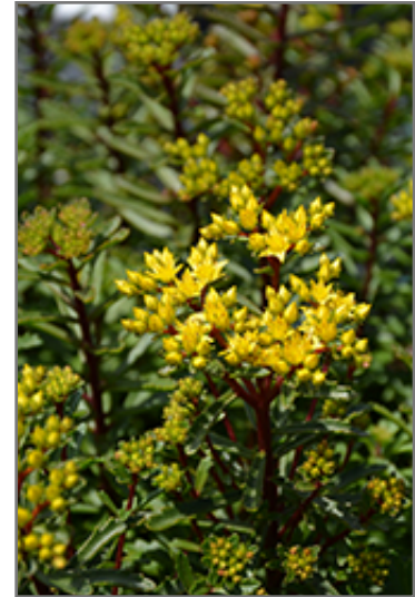
Yellow Diamonds Stonecrop flowers