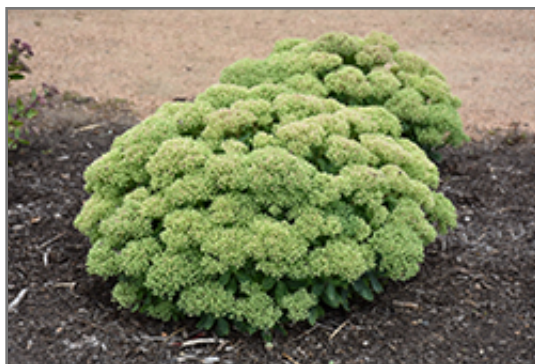
Lime Joy Stonecrop in bloom

A highly desirable and popular selection, forming a dense mound completely covered in broccoli-like pink and magenta bicolored flowers, succulent dusty-green foliage is prominent the rest of the season; needs a dry and sunny location