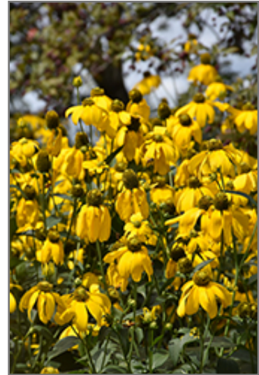
Cutleaf Coneflower flowers