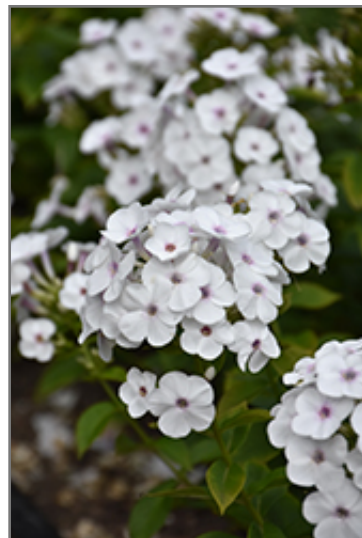
Super Ka-Pow White Garden Phlox flowers