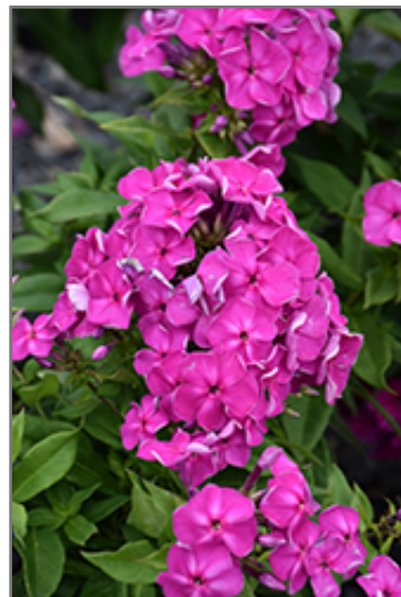
Super Ka-Pow Lavender Garden Phlox flowers