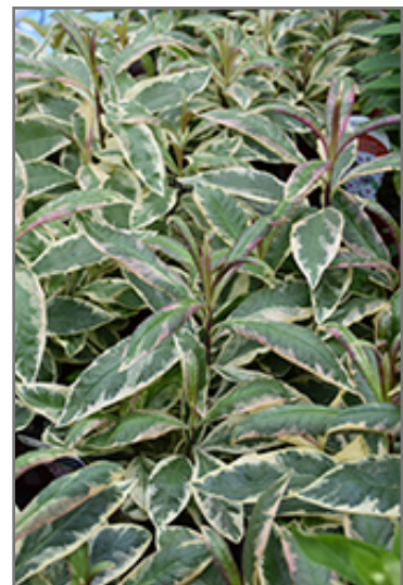
Olympus Garden Phlox foliage