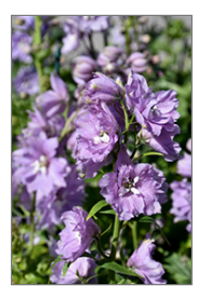
Magic Fountains Cherry Blossom Larkspur flowers

A wonderful compact series ideal for smaller gardens, borders or patio containers; low growing mounds of dark green foliage present tall sturdy stems, covered in beautiful semi-double flowers; excellent cut flower