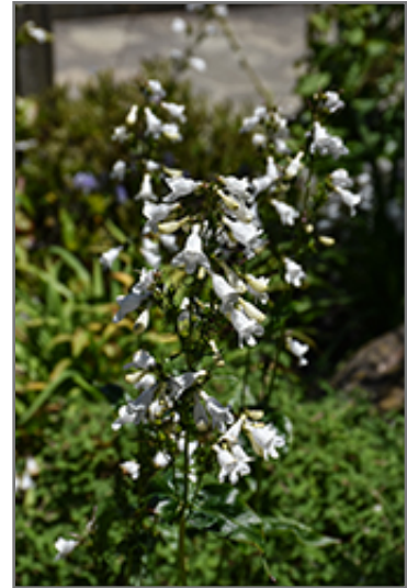
Foxglove Beardtongue flowers

Foxglove Beardtongue is recommended for the following landscape applications;