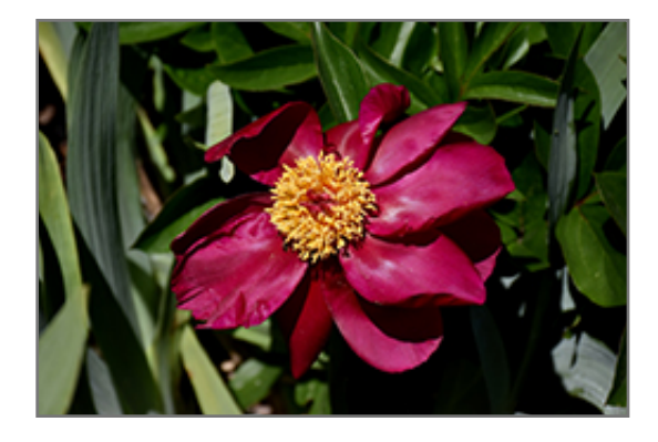
Topeka Garnet Peony flowers