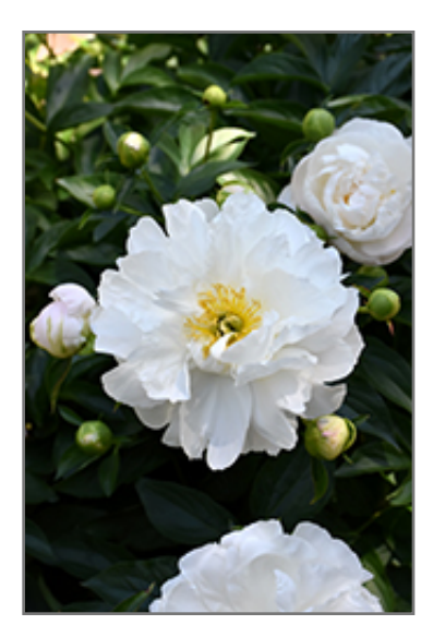
Miss America Peony flowers

A lovely early mid-season bloomer presenting shell pink flower buds, opening to bright white with yellow anthers; vigorous bushy mounds of deep green, glossy foliage; excellent cut flower quality; perfect for border planting and garden beds