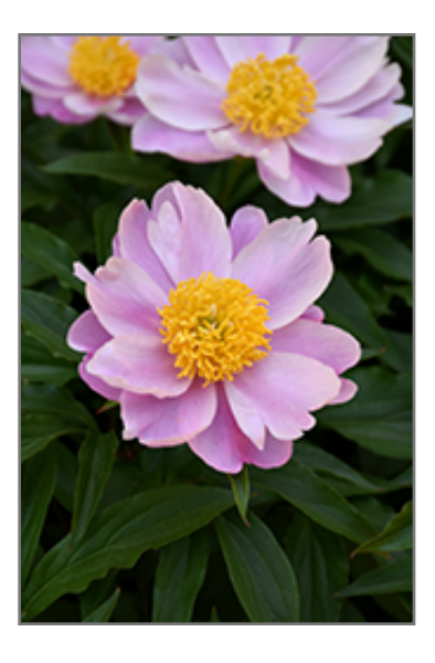
Chinese Peony flowers

Chinese Peony is recommended for the following landscape applications;