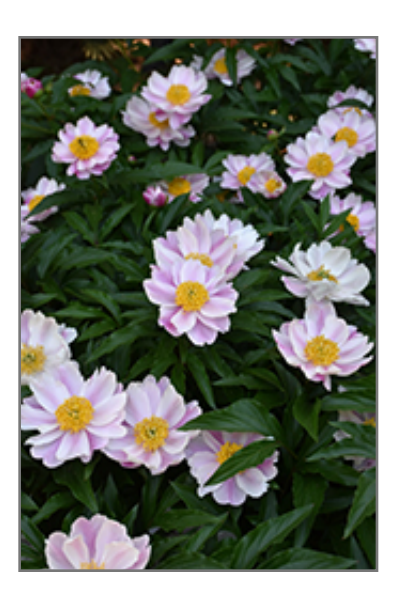
Chinese Peony flowers