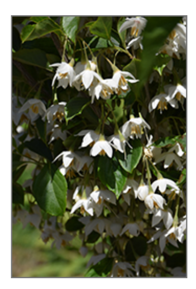
Spring Showers Japanese Snowbell flowers