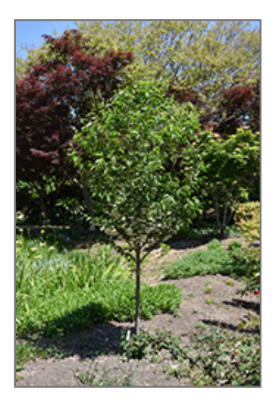
Spring Showers Japanese Snowbell in bloom