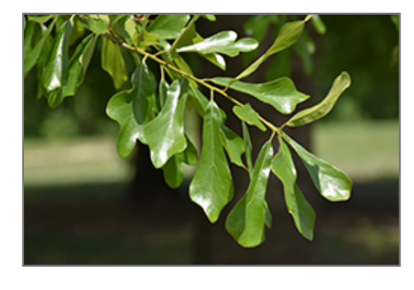
Water Oak foliage

Water Oak is a dense deciduous tree with a more or less rounded form. Its average texture blends into the landscape, but can be balanced by one or two finer or coarser trees or shrubs for an effective composition.