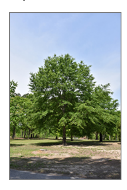
Water Oak

This tree will require occasional maintenance and upkeep, and is best pruned in late winter once the threat of extreme cold has passed. It is a good choice for attracting birds and squirrels to your yard. Gardeners should be aware of the following characteristic(s) that may warrant special consideration;