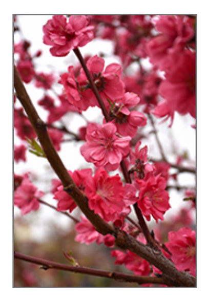
Magnifica Red Flowering Peach flowers

Magnifica Red Flowering Peach is recommended for the following landscape applications;