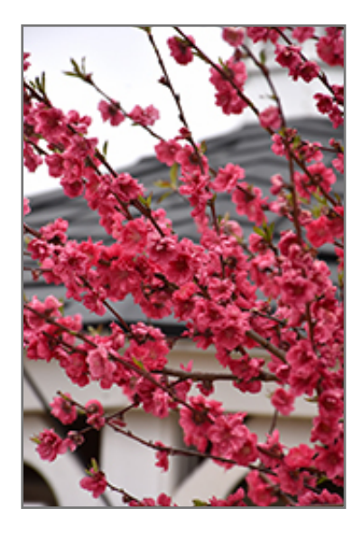
Magnifica Red Flowering Peach flowers