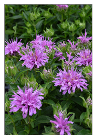
Leading Lady Orchid Beebalm flowers

This variety forms a dense, compact mound of orchid and pink bicolored flowers, on well branched, strong stems; lush dark green foliage has an excellent resistance to powdery mildew; great for massing along border fronts; attracts pollinators