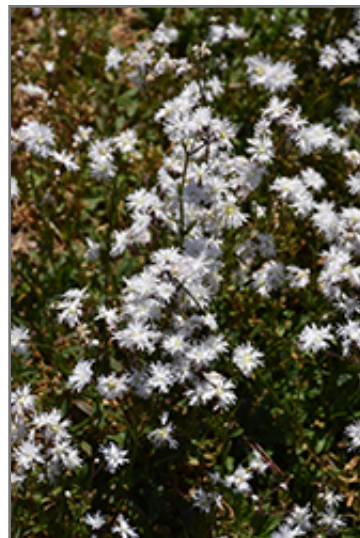
Petit Henri Ragged Robin Campion flowers