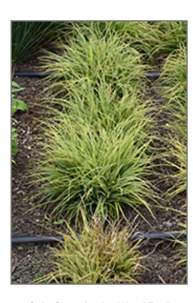
ColorGrass Lucius Wood Rush