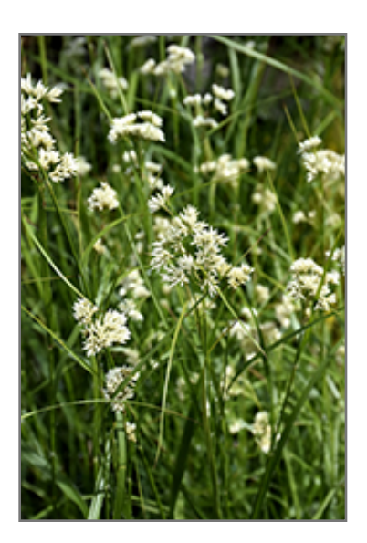
ColorGrass Lucius Wood Rush flowers