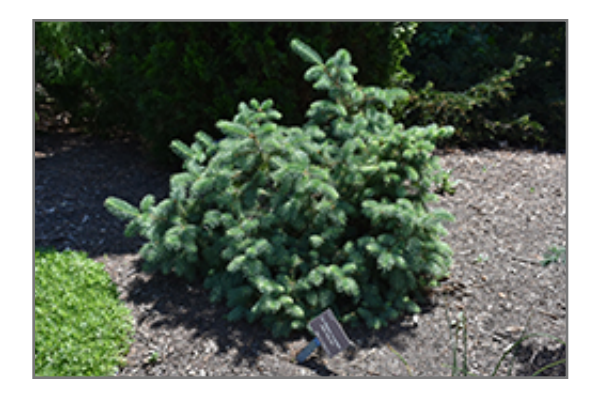
Candelabra Spruce