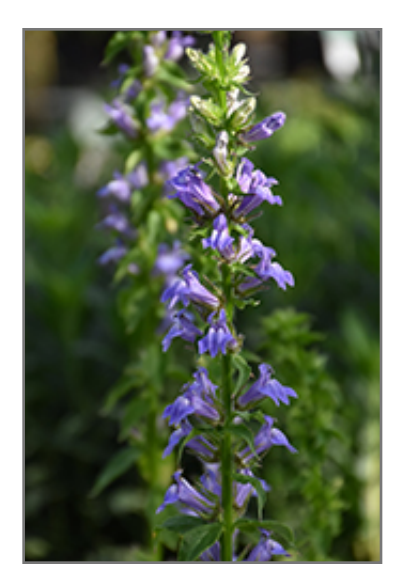
Great Blue Lobelia flowers

A wonderful upright selection featuring tall, long-lasting spikes of bright blue flowers, rising above finely toothed foliage; nectar filled blooms attract pollinators during the summer; low maintenance and easy to grow, ideal for borders and containers