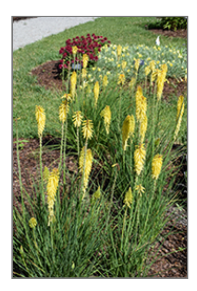
Glow Stick Torchlily in bloom