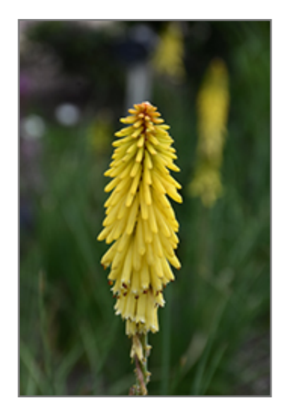
Glow Stick Torchlily flowers

Glow Stick Torchlily is recommended for the following landscape applications;