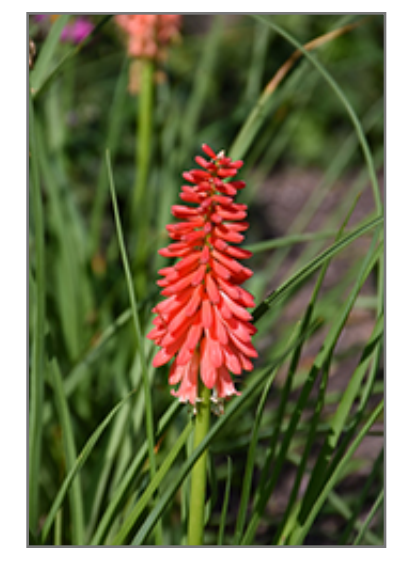
Color The Sky Crimson Torchlily flowers

An excellent, compact variety with an upright habit, presenting stunning crimson red flower stalks, rising above deep green grass-like foliage; creates an unusual border or container addition; great cut flower quality; attracts pollinators