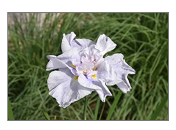
Dinner Plate Cupcake Japanese Iris flowers

An early to mid summer bloomer featuring tall stalks topped with beautiful, bright white flowers accented with purple and yellow; narrow, sword-shaped leaves; prefers well-drained, consistently moist soil; great for borders, beds and containers