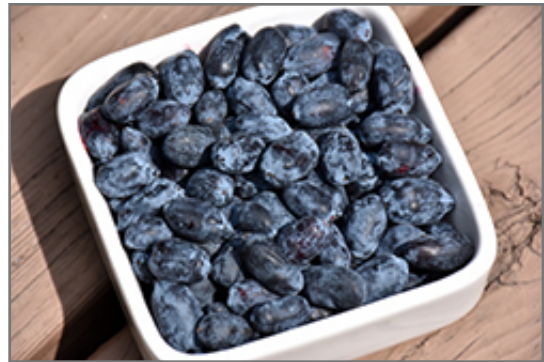
Boreal Beast Honeyberry fruit

This is a dense multi-stemmed deciduous shrub with a more or less rounded form. Its average texture blends into the landscape, but can be balanced by one or two finer or coarser trees or shrubs for an effective composition. This plant will require occasional maintenance and upkeep, and is best pruned in late winter once the threat of extreme cold has passed. It is a good choice for attracting butterflies to your yard. It has no significant negative characteristics.