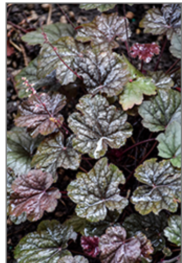
Steel City Coral Bells foliage