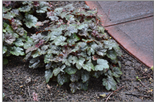
Steel City Coral Bells

Steel City Coral Bells is recommended for the following landscape applications;